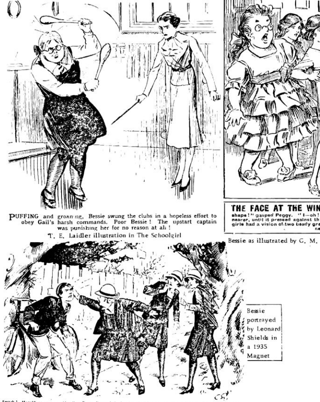
Smark 1. Mareléene gavo a wild well av Berur Bonter's fat hand timote his face. "Bessle 1" shrieked Marjorle Hazeldene "FB smark han again 1" tox laime 6 ML, Scatter, Canchy round the carried and dismayed Hazel. "FB give him porpose 1